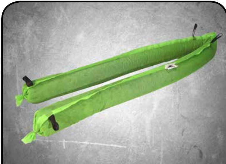
TRAVEL LANE WATTLE