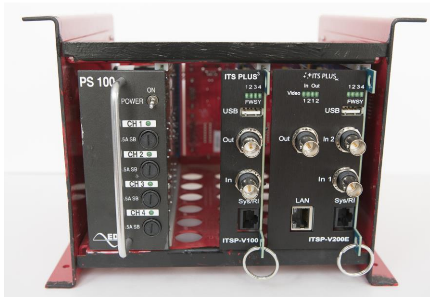
Single and Dual Channel ITSP-V100 and ITSP-V200E