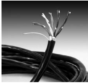
Opticom™ Model 138 Detector Cable