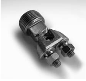
Opticom™ Span Wire Clamp