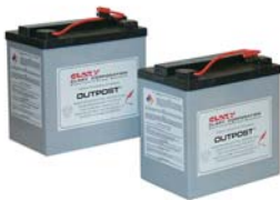
OPB-1241 / OPB-1251 or OP72A - Battery Set

These 41 and 51Ahr maintenance-free, Absorbent Glass Mat, Valve Regulated, Lead Acid (AGM-VRLA) batteries are designed for deep cycle, extreme temperature applications. They have been field tested and used for years by the military. Absorbent Glass Mat (AGM) technology assures a safe environment. Especially designed for outdoor and extreme temperature applications, they are capable of operating from -40^{\circ}\text{C} to +74^{\circ}\text{C} ( -40^{\circ}\text{F} to +165^{\circ}\text{F} ). This makes them ideal for use with Clary's SP1250PD PLUS Series Traffic Signal solutions, and IT communication solution or other extreme temperature applications.