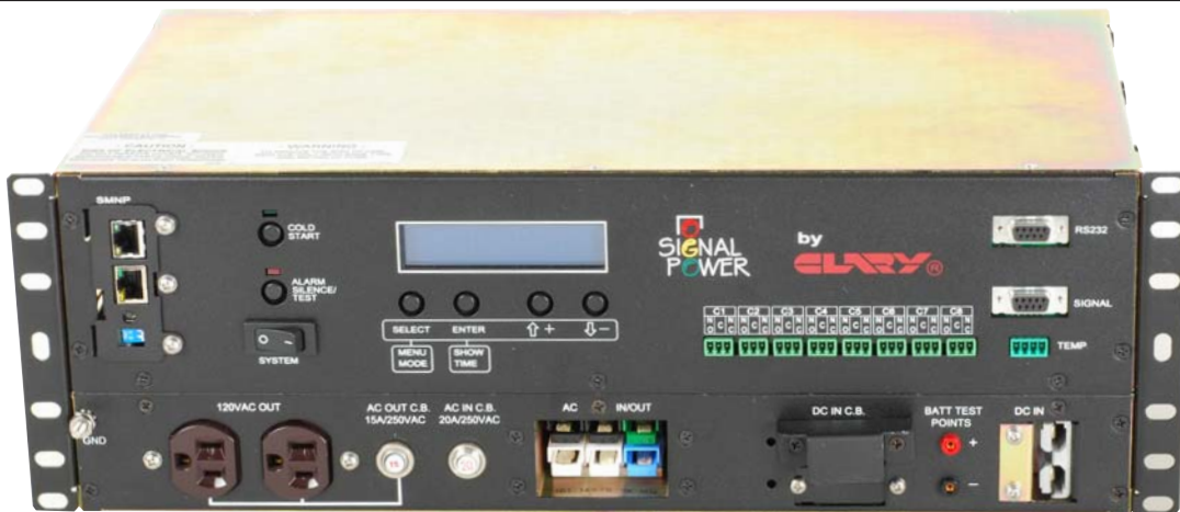
SP1250PD-N/R, SP1250PD-N/R (PLUS) or SP2000PD-N/R

The SP Series, Model PD UPS and the Outpost™ Series batteries are designed for outdoor use and will operate in extreme temperature environments of -40°C to +74°C (-40°F to +165°F).