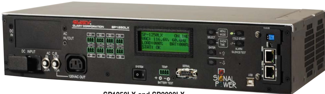
SP1250LX and SP2000LX

The SP1250LX, SP2000LX and the Outpost™ Series batteries are designed for outdoor use and will operate in extreme temperature environments of -40°C to +74°C (-40°F to +165°F).