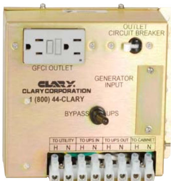
SPD-302C By-pass Switch with GFCI Plug, Circuit Breaker and Generator Plug

Keeping intersections alive during power failures, Clary's SP1250LX or SP2000LX are the world's most advanced Uninterruptible Power System (UPS) for traffic applications. Without compromising existing cabinet wiring, the SP1250LX or SP2000LX keeps LED signal heads running for up to 8 hours or more during power failures. Clary's continuous power systems fit inside most existing cabinets and meet NEMA temperature specifications. Optional, NEMA 3R Type II and Type III cabinets are available.