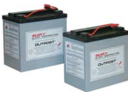
OPB-1241 / OPB-1251 or OP72A - Battery Set

These 41 and 51Ahr maintenance-free, Absorbent Glass Mat, Valve Regulated, Lead Acid (AGM-VRLA) batteries are designed for deep cycle, extreme temperature applications. They have been field tested and used for years by the military. Absorbent Glass Mat (AGM) technology assures a safe environment. Especially designed for outdoor and extreme temperature applications, they are capable of operating from -40^{\circ}\text{C} to +74^{\circ}\text{C} ( -40^{\circ}\text{F} to +165^{\circ}\text{F} ). This makes them ideal for use with Clary's SP1250PD PLUS Series Traffic Signal solutions, and IT communication solution or other extreme temperature applications.