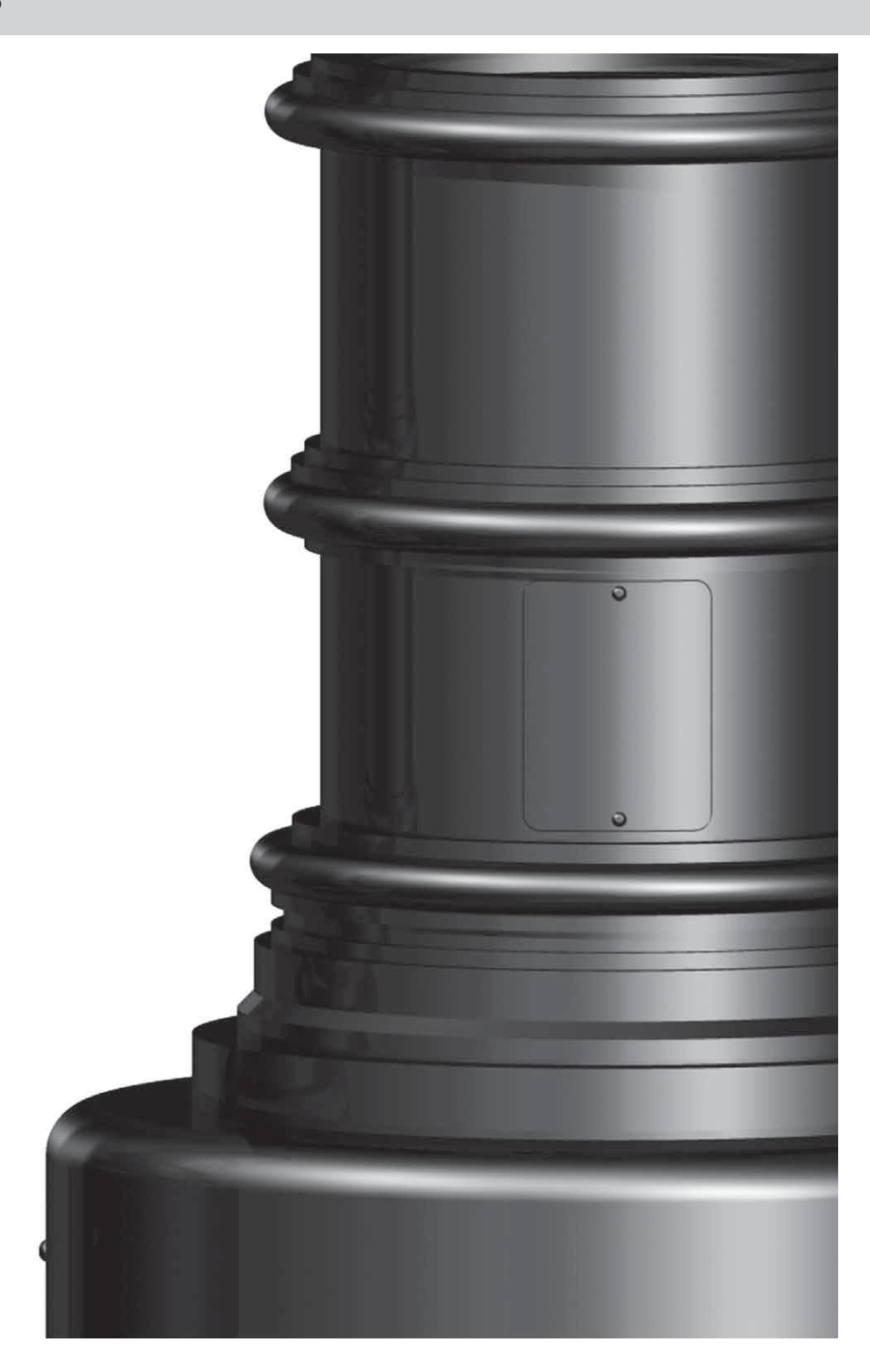
SPC7260 04/09 valmontstructures.com carries the most current spec information and supersedes these guidelines.