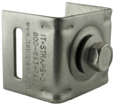
Stainless Steel Bull's Eye™ Sign Mounting Brackets Straight Leg w/Stainless Steel Bolt & Washer 50 per Box – #SB001

http://isostainless.com/product/stainless-steel-bulls-eye-sign-mounting-brackets-straight-leg-wstainless-steel-bolt-washer-50-per-box-sb001-2/