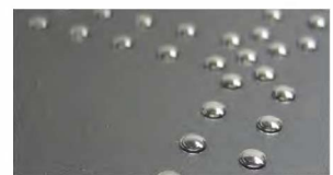
Individual Protective Lenses Close-up View of Sign Digit