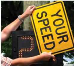
Folding Sign Plate

Battery Power: Lithium ion batteries offers extended operation with choice of 9.6V, 10Ah battery for two week performance or 12.8V, 15Ah battery for four week performance before recharge under normal operating conditions.