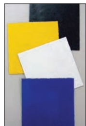
HotSpot colors available: Black, yellow, white, blue

torch is the same as other HotTape™ markings on concrete and asphalt. No sealers are required. Simply apply marker to melted HotSpot.