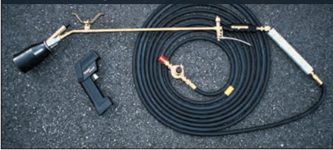
Recommended Magnum Heat Torch and Infrared Thermometer

Because of its flexible characteristics, HotTape™ 90-mil linear material is available in rolls.