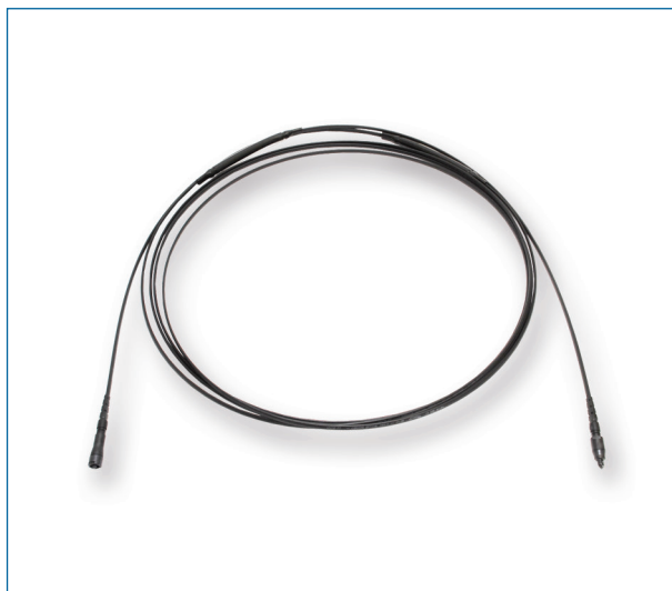
OptiTip Interconnect Harness Assembly | Photo CCA225

OptiTip assemblies are available with SST-Drop™ Outdoor Cable or FREEDM® Flat Drop Indoor/Outdoor LSZH cable which allows for easy migration of indoor and outdoor applications. The OptiTip Assembly is available with either pinned or non-pinned OptiTip MT Connectors to match your network needs.