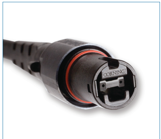
OptiTip MT Connector | Photo LAN1000