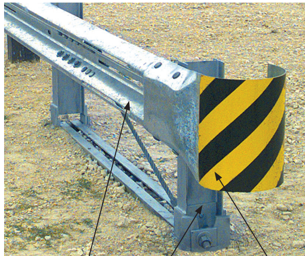
SRT-350 6 POST™