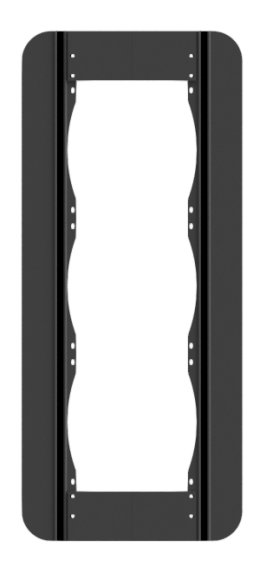
BK-8100-3-EagleSG-PNC 12", 3-Section Eagle SG EXAMPLE

Note: Designed to fit specific signal manufacturers.